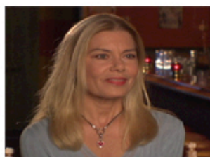
Candida Royale Veteran adult film star