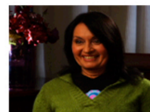
Samantha Fox Veteran adult film star