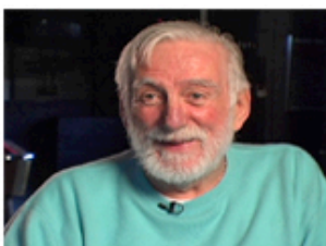
Rod McKuen Poet, composer & singer