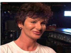
Sharon Mitchell Veteran adult film star