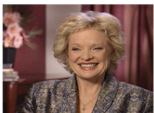
Christine Ebersole Tony Award-winning actress (Grey Gardens) & singer