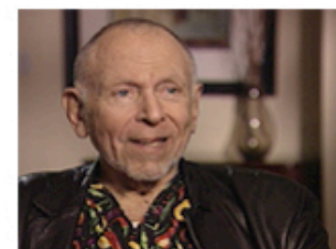
Al Goldstein Founder of Screw magazine & host of Midnight Blue