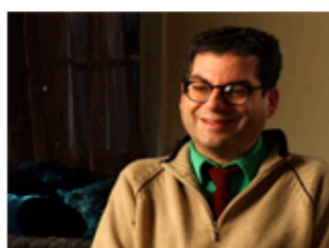
Michael Musto Village Voice gossip columnist