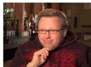
Chi Chi La Rue Prolific adult film director & drag performer