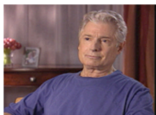
Jack Wrangler Star of stage and screen