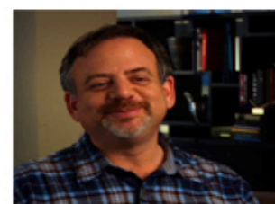
Marc Shaiman Tony Award-winning composer & lyricist (Hairspray, South Park)