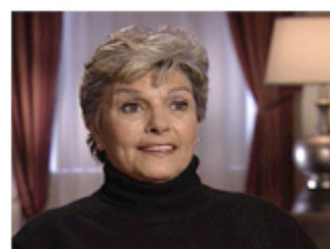
Gloria Leonard Veteran adult film star