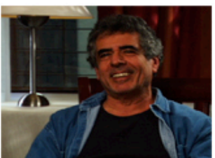
Jamie Gillis Veteran adult film star