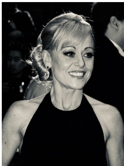
TRACIE BENNETT as Charlotte Christian

TRACIE BENNETT is best known for her many award-winning performances in the West End and on Broadway. She is a double Olivier Award winner and has been nominated on a further four occasions. She also received a Tony Award nomination for her extraordinary portrayal of Judy Garland in End of the Rainbow .