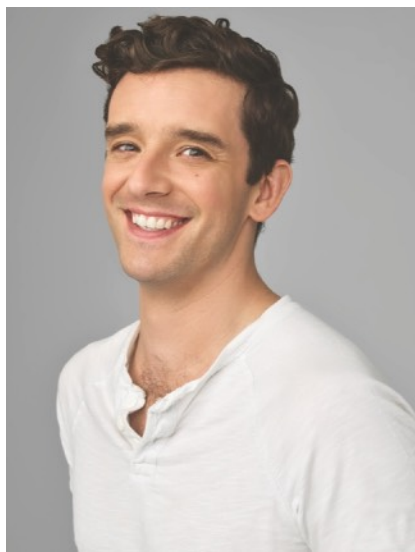
MICHAEL URIE as Jay Mulch

MICHAEL URIE was seen last season in back to back New York theatre productions beginning with the Public Theater's revival of Tony Kushner's A Bright Room Called Day and followed by the Broadway premiere of Bess Wohl's Grand Horizons . Prior to that, he starred in the Tony Award nominated Broadway revival of Harvey Fierstein Torch Song , following his critically acclaimed performance in the off-Broadway production at Second Stage, earning Lucille Lortel Award and Drama League Award nominations. Michael originated the role of Alex More in Jonathan Tolins' Buyer & Cellar Off-Broadway, on tour, and in London, for which he received the Drama Desk Award, Clarence Derwent Award, the Lucille Lortel Award, LA Drama Critics Award and nominations for the Drama League and Outer Critics Circle Awards.