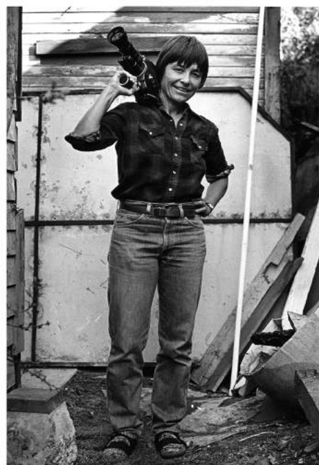
Barbara Hammer, pioneer of lesbian cinema.

This documentary is not narrated; the filmmakers tell their own stories, blending personal experiences with a narrative about the evolution of lesbian cinema. DYKES, CAMERA, ACTION! brings together humor, pathos, and political/historical moments to form the film's arc: the larger history of the gay liberation movements in the context of cinema.