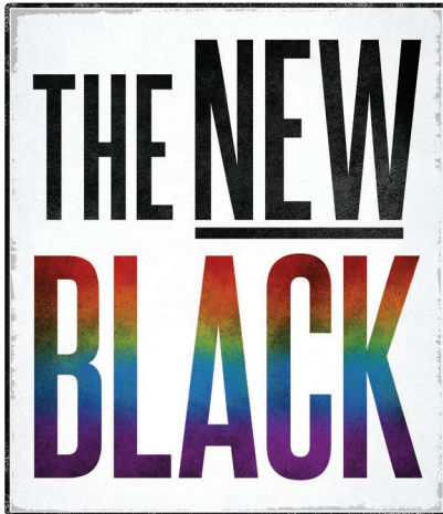
A DOCUMENTARY FILM BY YORUBA RICHEN