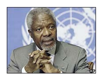
Ghana's most famous son Kofi Annan is recognized throughout the world as the public face of the United Nations.

1482 Portugal sets up a trading settlement.