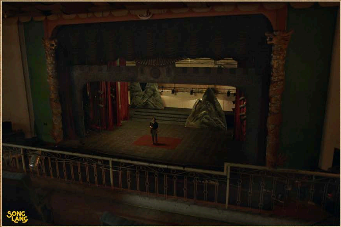
Isaac (Linh Phung)